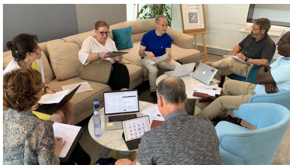
IAIR Executive Committee and Board Members meeting at the 2019 Shanghai Conference (before we knew about social-distancing)